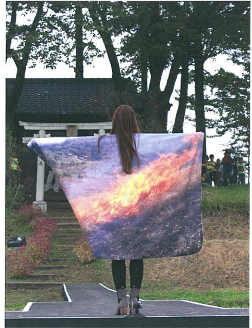
Timeline Photos October 13th, 2015 at 8:30 AM