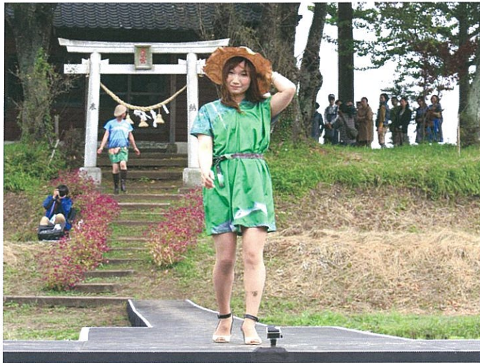
Farmer who grows rice and tabac.

Timeline Photos - October 13th, 2015 at 5:05 PM