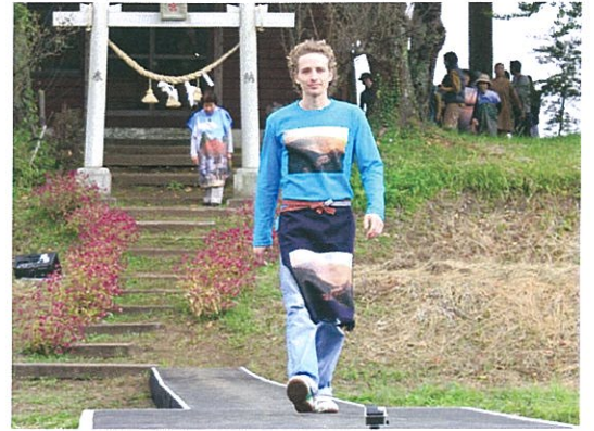
Freshman trainee who wants to be a farmer in Japan.