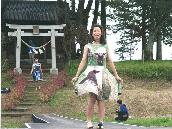
Local high school student wearing a dress printed with a picture of their sheep.

Timeline Photos - October 13th, 2015 at 12:00 PM