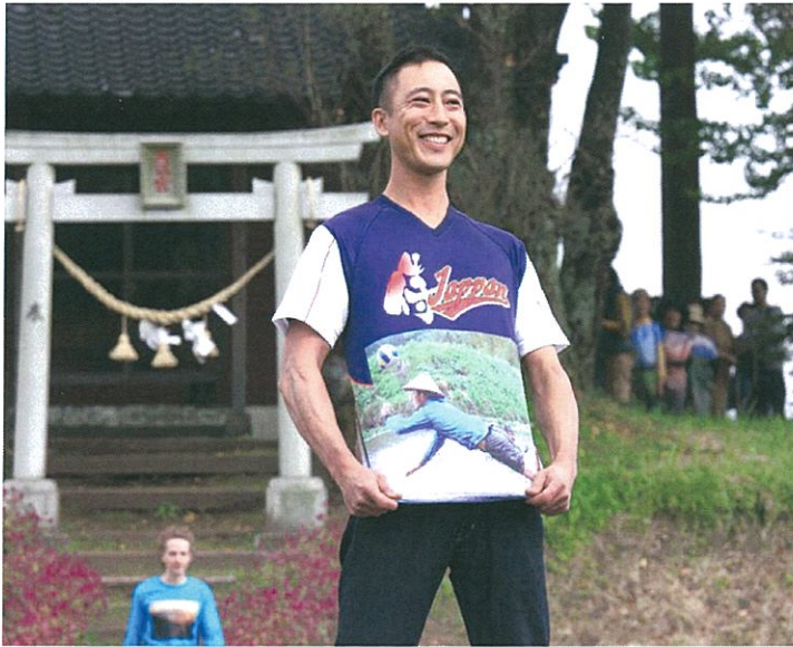
Freshman trainee who wants to be a farmer.

Timeline Photos - October 13th, 2015 at 12:00 PM