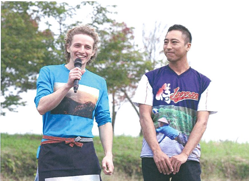
Fresh guys with fresh smiles!

Timeline Photos - October 13th, 2015 at 12:00 PM