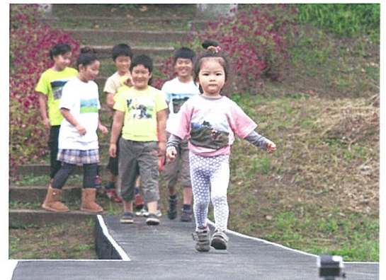
Kids can hardly wait to be on stage!