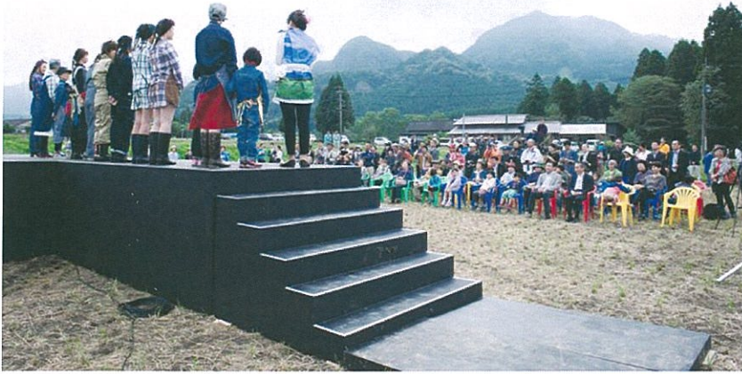
☐ Timeline Photos - October 13th, 2015 at 5:25 PM