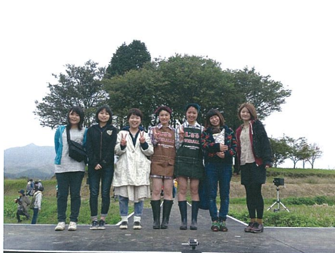
☐ Timeline Photos - October 13th, 2015 at 6:10 PM