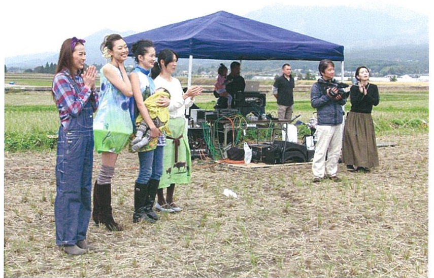
☐ Timeline Photos - October 13th, 2015 at 5:37 PM