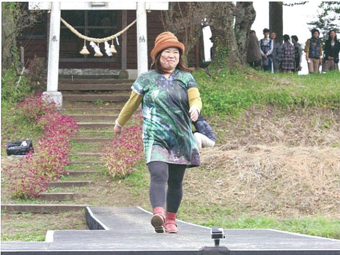
Farmer who grows asparagus.

Timeline Photos - October 13th, 2015 at 5:07 PM