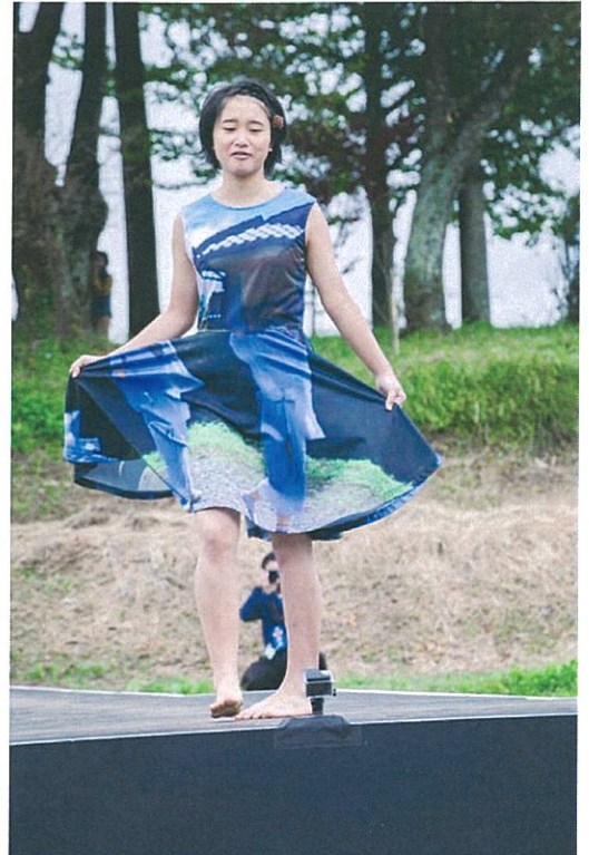
Local high school student wearing a dress with a picture of local festival.