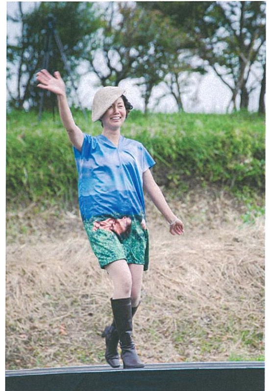
Farmer who grows red cattle, the local species