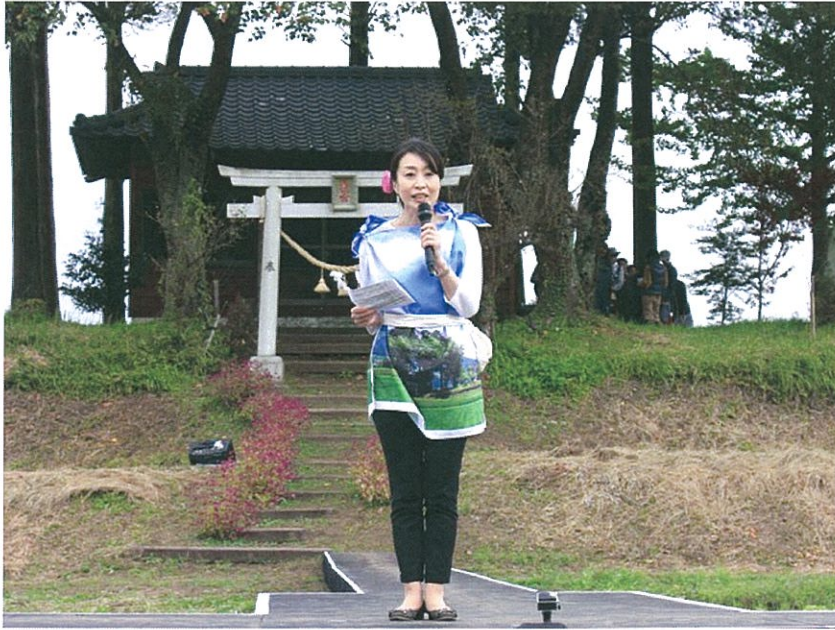
Timeline Photos - October 13th, 2015 at 5:48 PM