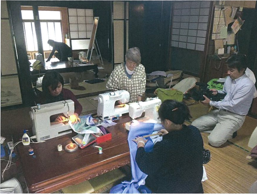
Timeline Photos - October 13th, 2015 at 6:02 PM