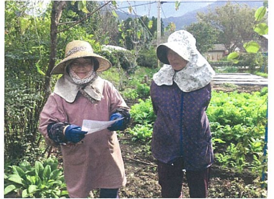
☐ Timeline Photos - October 13th, 2015 at 6:13 PM