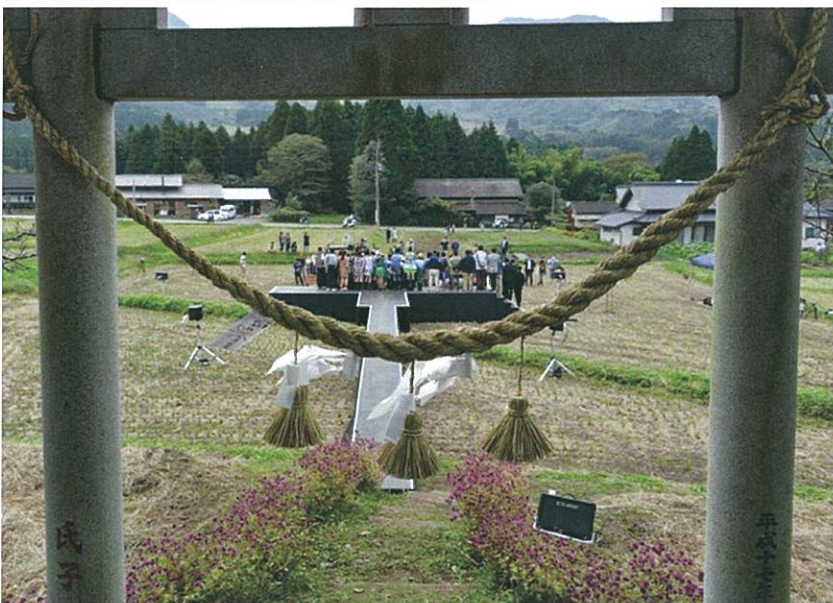
Timeline Photos - October 13th, 2015 at 5:52 PM