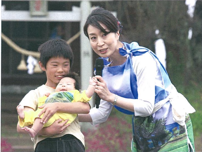
9-year boy with 2-month old sister.

Timeline Photos - October 13th, 2015 at 4:37 PM