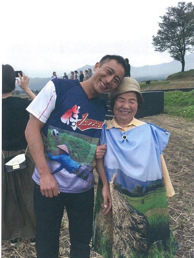
☐ Timeline Photos - October 13th, 2015 at 6:09 PM