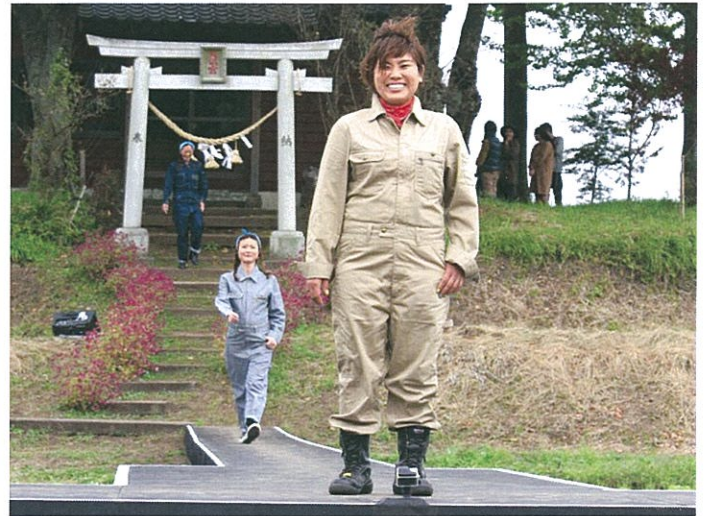
Farmer who grows asparagus.