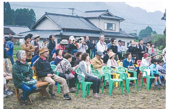
More than 100 audiences gathered to enjoy the fashion show.