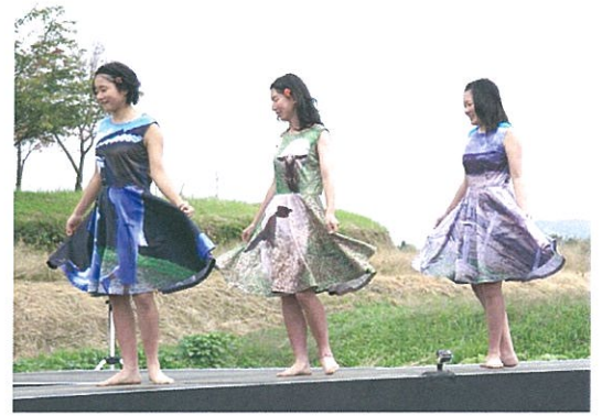
☐ Timeline Photos - October 13th, 2015 at 5:36 PM