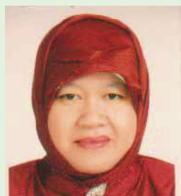
Ms. Tri Rismaharini

Surabaya city's first female mayor. Master of Surabaya Institute of Technology in 2002. Project manager of the Inca land use development planning committee in 1997, director of integrated information architecture office in 2001, Project Manager of the office of park planning and bureau chief in 2002, Director of Parks, Beautification Director of Development Studies, 2005 Incumbent chairman of the development plan, 2008, from 2010.