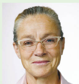
Ms. Ritt Bjerregaard

She obtained a Teaching Degree in 1964. Since 1973. She has held numerous political positions as a minister in the Danish Government, as well as an EU Commissioner for Environment. From 2006 to 2010 she was Lord Mayor of City of Copenhagen, the capital of Denmark. During her time as Lord Mayor, she adopted several environmental regulations including a bill on making Copenhagen the world's first carbon neutral capital by 2025.